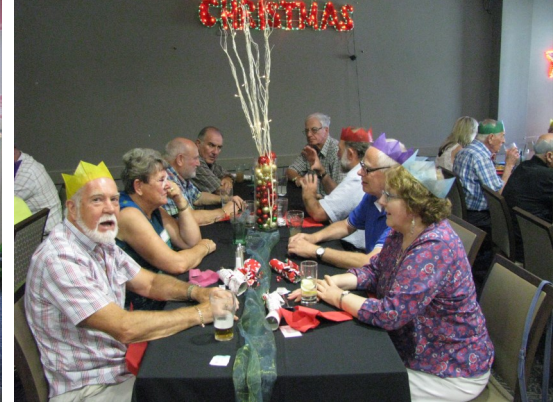
Christmas Lunch at the Penrith Bowling Club