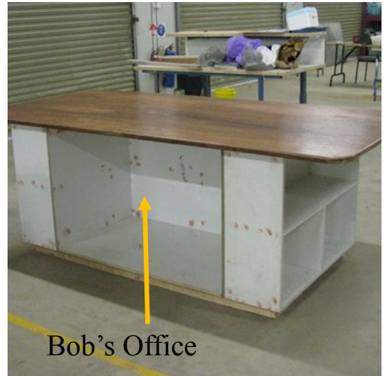
The 2nd work bench nearing completion

As each week goes be get more crowded in our "Close to Nature" Shed.