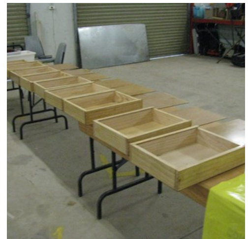
David's tool box production line