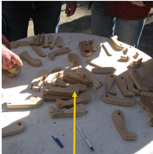
Sorting out the toy components for Bunnings Fathers Day Event