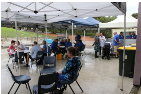
Despite the rainy day, the BBQ team managed to feed around 300 people. What a great effort.