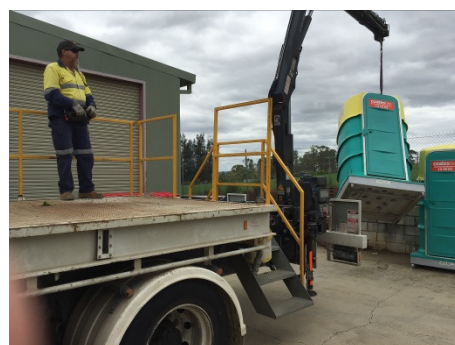
Well, it is one of those essential things and our septic system could not have coped. Sorry boys, you use outside.