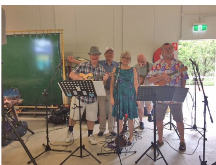
The Little Black Ducks provided some great morning entertainment.