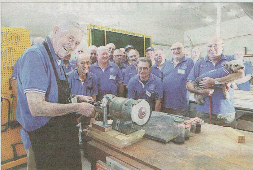
Nepean Men's Shed members are excited about the opening of their new facility

The Nepean Men's Shed is one of three Men's Shed organisations in the Penrith region, the others being Penrith Community Men's Shed at Caddens and District Men's Shed at St Clair.