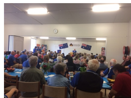
All seats taken, standing at the back and nearly out the door for the opening ceremony. What a great turnout and lots of interest by the older community.