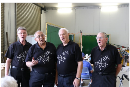
The Silver Fox Barbershop Quartet provided some great harmony in the afternoon. No instruments, just some great harmony.