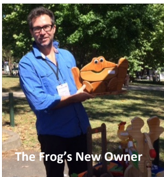
The Frog's New Owner

Finally, Penrith Council have sent us the following email.